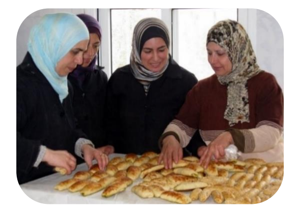
Women entrepreneurs

This morning I met thirty lovely, inspiring women, who have insisted on lighting a candle in our lives rather than cursing the darkness. They have worked hard and have engraved their bravery into the rocks,