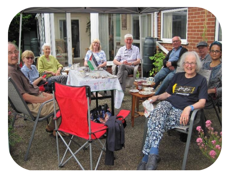
Rotherham Friends of Palestine enjoying afternoon tea

In July 2021 the Rotherham Friends of Palestine group held an Afternoon Tea. This fundraising event was the first occasion we'd been able to meet since before the start of the pandemic and it was just wonderful to be able to spend time together. It was a sunny day and we raised a fantastic £285 including donations from people who weren't able to join us. We talked about the Scholarship students and were full of admiration for their determination, passion and courage in continuing their studies in