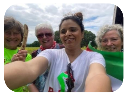
Setting off on the Sheffield Way walk with the olive branch

but for the Children's Healing Project in Gaza. We set ourselves a fundraising target of £10,000 so that each project would receive £5000. This felt hugely ambitious, perhaps impossible, as we could only organise very limited activities in Meersbrook Park and we had to rely on supporters to do their own Do-it Yourself activities. But rely on them we could! Supporters ran and walked and swam and did all manner of activity both in their own homes