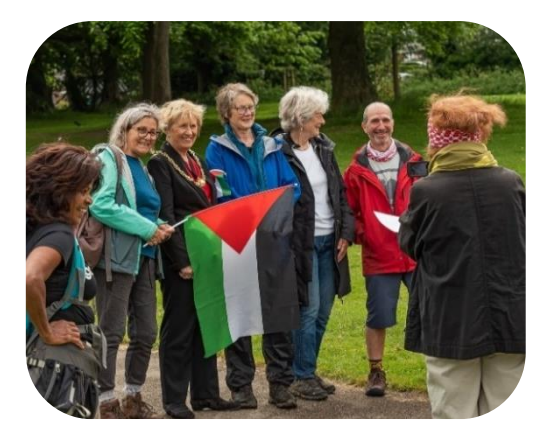
The Lord Mayor offers congratulations at the end of the Sheffield Way walk

The walk was in solidarity with our partners and friends in Palestine and with our SPWSF students, who have very limited access to roam in Gaza and the West Bank. At the end of Small Park BIG Run we linked up with our partners and friends in Palestine, as we do every year. This was a wonderful and very moving occasion. You can find clips from this online event plus more information on SPBR on our website: <a href="http://spbr.sheffieldpsc.org.uk">http://spbr.sheffieldpsc.org.uk</a>.