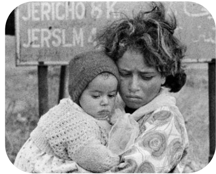
Sisters

2018 marked the 70 th anniversary of the Nakba. Nakba is the Arabic word for catastrophe or disaster and is used to describe the ethnic cleansing and colonisation of Palestine, a process which continues to this day. When planning our biennial International Women's Day (IWD) event for 2018, the Northern Women for Palestine Group decided to