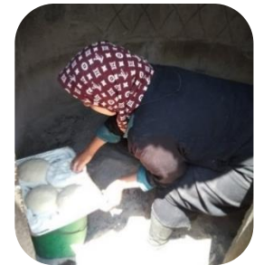
Baking bread in Massafer Yatta community

I visited villages in Massafer Yatta in the South Hebron hills where the Israeli government wants to confiscate all Palestinian land for Israeli settlements. The community practices non-violent resistance with some successes including getting sections of the wall removed. Women are equally active and some girls from this sheep farming area are now at university. The community included young Italians who escort the primary-age children to school to prevent settlers attacking them. Every obstacle thrown at them by Israeli soldiers is challenged and I found the same determination everywhere I went.