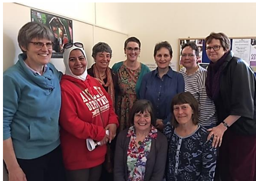
The Scholarship Fund Organising Group in Sheffield

In Britain the Fund's supporters make donations or monthly contributions through a standing order, and/or by organising or taking part in fundraising events. Any contribution is much appreciated. Standing orders are particularly welcome as they enable us to estimate our income more accurately and to plan.