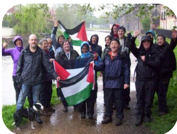
Spring sponsored walk

Over the last year members of the Bolton Socialist Club have raised £2,400 for the Sheffield Palestine Women's Scholarship Fund. Every spring we organise a sponsored walk and every