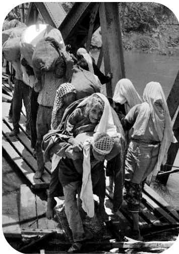
Alenby Bridge 1948

commemorate this historic event, dispelling myths and celebrating the resistance and resilience of Palestinian women. We also wanted to connect the Palestinian cause with women worldwide, in particular asylum seekers and refugees.