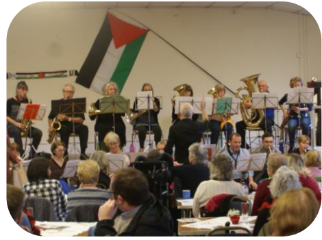
Audience and Late Start Wind Band at our autumn event