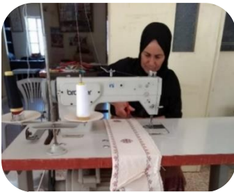
A member of the Surif Women's Co-op.

Ramallah is full of building sites – new blocks of flats appearing everywhere – but it is the scale of settlement building in the West Bank that dwarfs everything. The Israeli settlements stretch for miles and dominate the skyline and will soon cut the West Bank in half. One settlement we drove through had sprinkler hosepipes on green lawns whereas most of the West Bank was baked dry under the hot July sun.