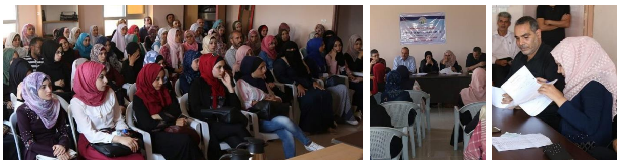
2018 award ceremony hosted by our partner organisation, Afaq Jadeeda, in Gaza

This year we are funding 65 students. This amazing number is due to the ongoing generosity of our supporters and to the large donations we received (see page 7). We have taken on 33 new students whilst 9 have graduated (see details on page 12 – congratulations to all of them!) and a further 6 discontinued their studies – one because she married, the other five because unfortunately they did not achieve sufficiently high grades. We wish all of our current students success in the coming year!