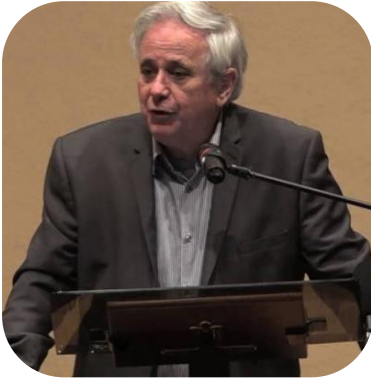
Professor Ilan Pappé