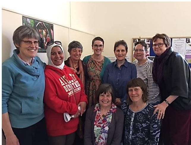
Members of the Sheffield Scholarship Fund Organising Group

In Britain the Fund's supporters make donations or monthly contributions through a standing order, and/or by organising or taking part in fundraising events. Any contribution is much appreciated. Standing orders are particularly welcome as they enable us to estimate our income more accurately and to plan.